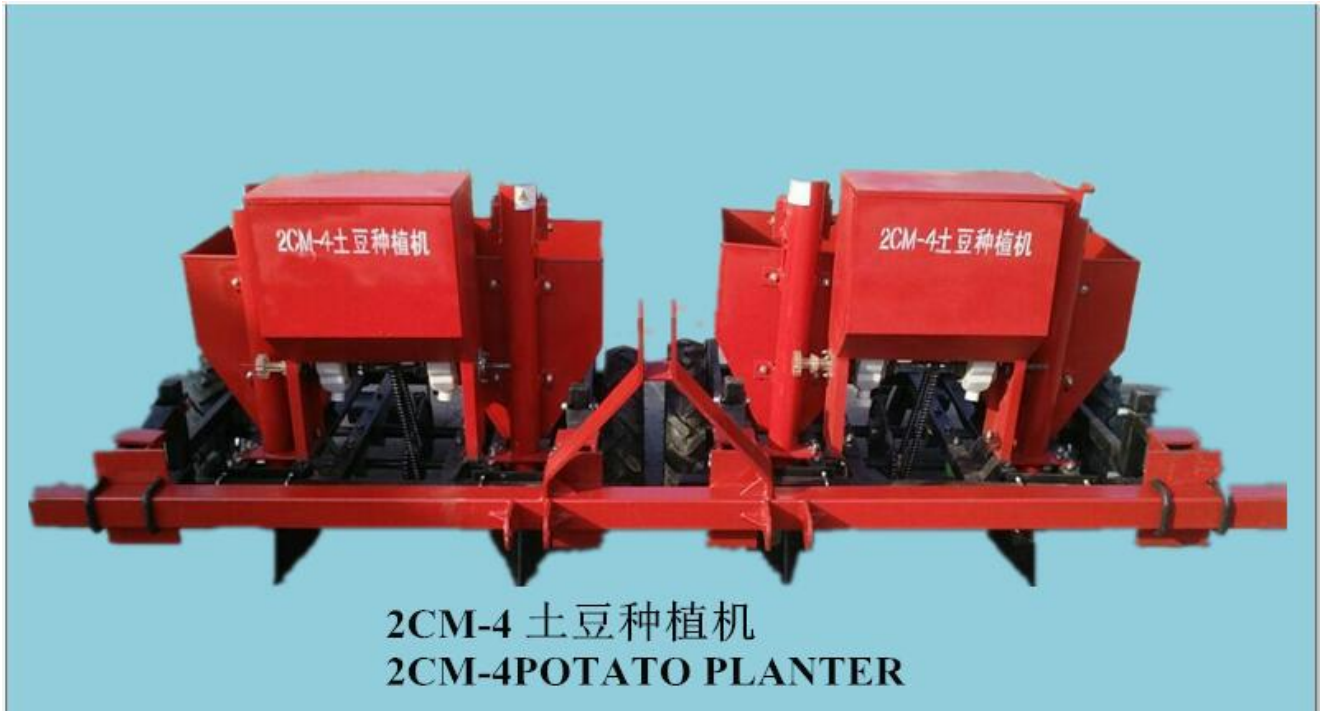
2CM-4 土豆种植机 2CM-4POTATO PLANTER